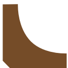
B51 45 x 45 Scotia